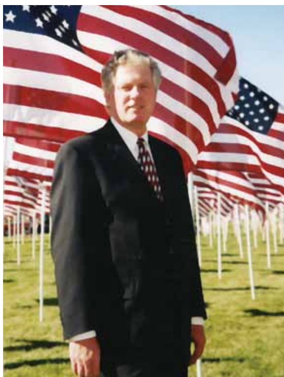
REP. TODD KISER

Together we can see challenges not as problems, but as opportunities for a well-positioned state and people.